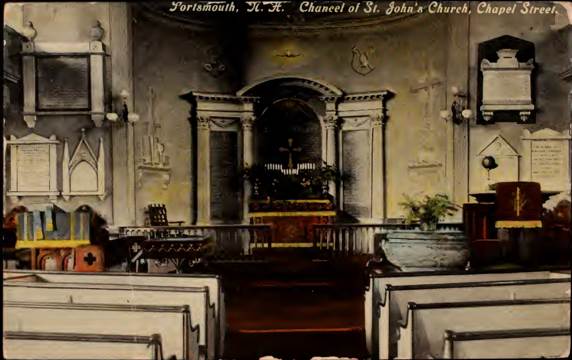
Portsmouth, N. H. Chancel of St. John's Church, Chapel Street.