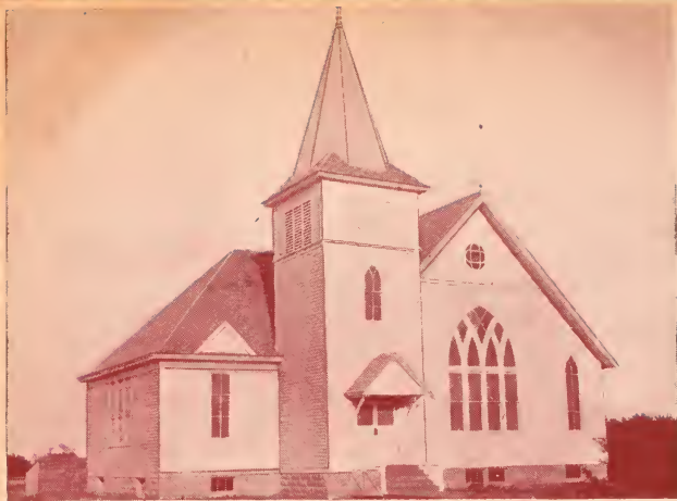
FRIENDS CHURCH, HAVILAND, KANSAS